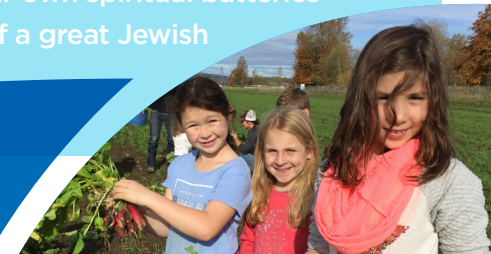
Sukkot Gleaning Project