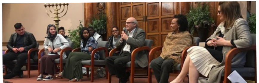
Yom HaShoah Event

Another focus during this very challenging year has been on taking care of our community. The Caring Committee has continued to provide meals and other tangible support to individuals and families at times of need. But, with anti-Semitism rearing its head locally and with a feeling that many of our core values are under attack in our American society at large, Kavana has also tried to respond on a communal level. During the course of the year, we offered workshops on resilience and self-care, parenting through turbulent times, and combatting anti-Semitism, and our rabbis have both participated in extra mental health training.