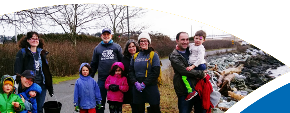
Environmental Beach Cleanup