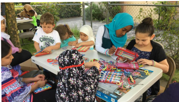
Idris Mosque Interfaith Event