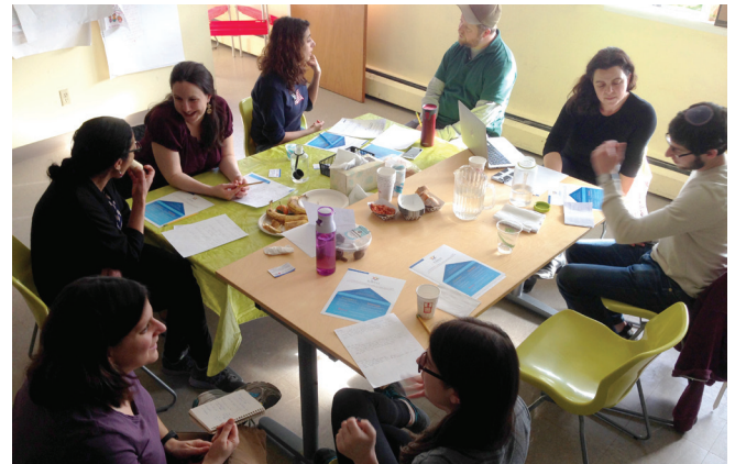
Members of our teaching staff discuss how Kavana's Strategic Purpose and Plan can be implemented across all of our programs, with both children and adults.