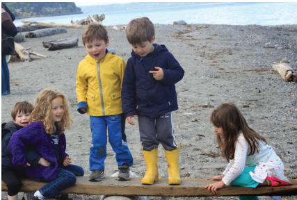
Preschoolers from Gan Kavana hit the beach at Carkeek Park to learn (in Hebrew!) about marine life and to build community.